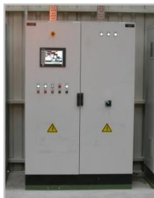
Control Cabinets due to EN 746 - 2 Safety Standard