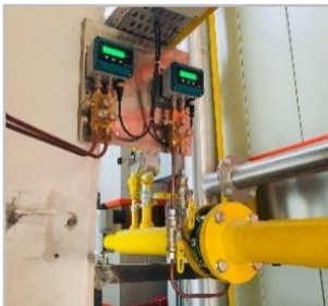
Gas & Air Flow Meters